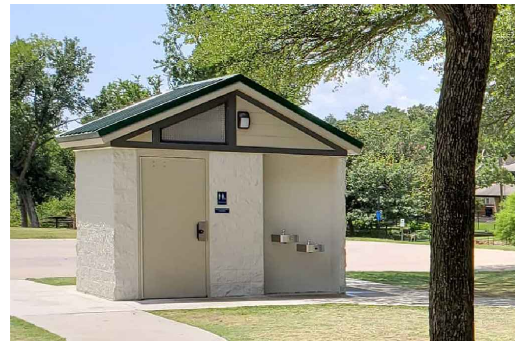
RESTROOM / BEAR PROOF RECEPTACLE / DOG CLEAN-UP STATION