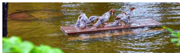
Skater's cabin picnic table/duck raft

If you have a disability that makes it difficult to attend city-sponsored functions, You may contact 424-6200 for assistance.